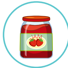
JAM OR JELLY