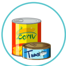
CANNED MEAT, FISH OR VEGETABLES