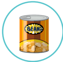
BEANS DRIED OR CANNED