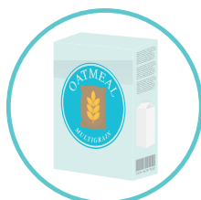
CEREAL HOT OR COLD