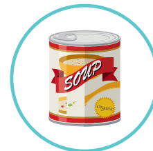
SOUPS OR STEWS